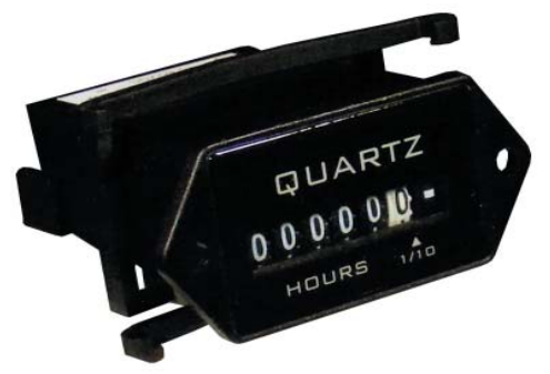
Rectangle Bezel Model #638-04